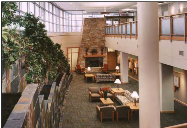
View from the Garden Court at the new Rice Memorial Hospital

Are you a medical professional seeking to "come back home" to the Willmar area? We would love to hear from you! Visit the Bring Them Back Home website at www.kandiyohi.com