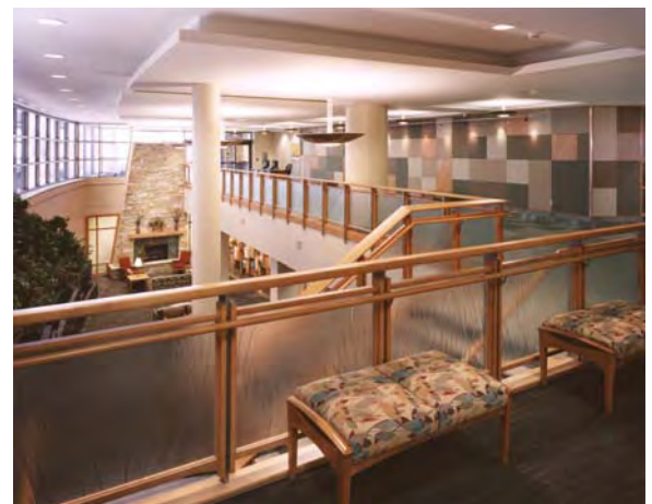
The Mezzanine in the new Rice Memorial Hospital

The New Rice is a state-of-the-art, intelligently designed facility that is convenient and easy to use. It's an entirely new way of delivering health care, one that makes the patient the focus of all that we do. (Continued)