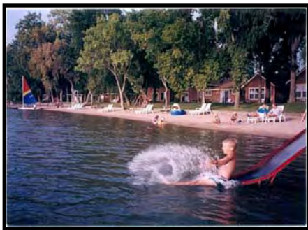
Dickerson's Lake Florida Resort